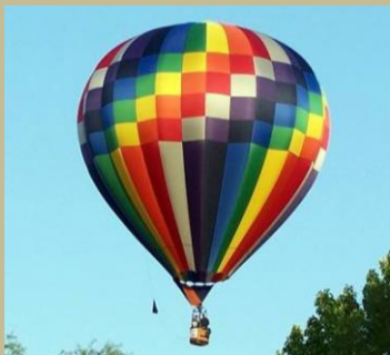
The Hot Air Balloon