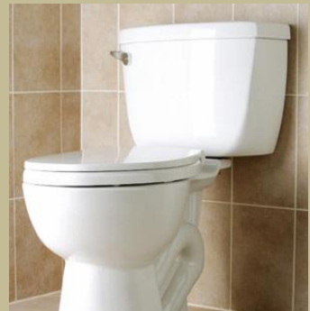
The Flush Toilet