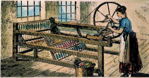
The Spinning Jenny

These are some of the major innovations/discoveries that have come out of the period we have studied in class, known as the Industrial Revolution. You will have to choose THREE to research. There are a lot of other inventions/discoveries too! If there is something you would like to research that is not on this list, you may do so (just okay it with me first please).